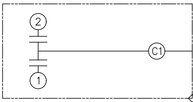
SCHEMATIC DIAGRAM - 201